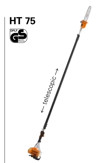
25.4 cm³, 0.95 kW /1.3 hp, 7.3 kg <sup>①</sup>. With the STIHL HT 75 pole pruner, branches up to a height of approx. 5 m can be cut.