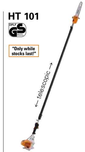
31.4 cm³, 1.05 kW /1.4 hp, 7.6 kg <sup>①</sup>. Professional pole pruner for fruit growers and arborists. Particularly precise biting characteristics thanks to special <sup>3</sup>/<sub>8</sub>" P PMM3 saw chain, 4-MIX <sup>®</sup> engine, STIHL anti-vibration system, automatic decompression, telescopic shaft, total length 270 – 390 cm.